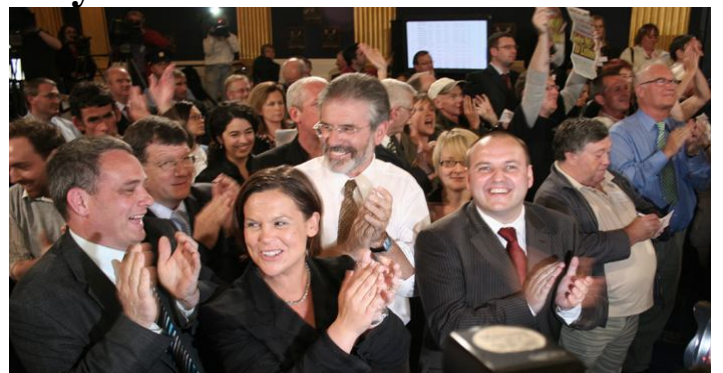
Politicians and business leaders celebrate

Champagne flowed last night as leading scientists, politicians and business people celebrated New Zealand's achievement in the '50 by 2050' campaign at Hamilton's Waikato Innovation Park. The New Zealand Government and the Cairns Group for liberalisation of global agricultural trade signed an agreement with the global science network, Coalition of the Concerned (CoC), back in 2012. The key thrust of the agreement was to develop 50 new technologies by 2050 "to improve human health through improvements to agricultural practices and the natural resource base".