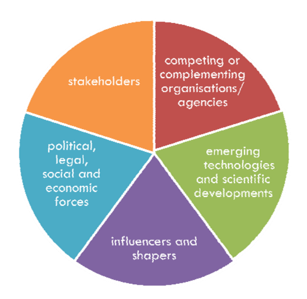
Figure 2: framework used to determine areas of the periphery to scan<sup>6</sup>

For example in the United Kingdom, government-sponsored horizon scans have informed policy such as the 'Healthy Weight, Healthy Lives: a cross-government strategy for England' and lead to development of co-ordinated action plans, for key stakeholder from across and outside Government, on coastal and flood planning (<a href="http://www.foresight.gov.uk/index.asp">http://www.foresight.gov.uk/index.asp</a>).